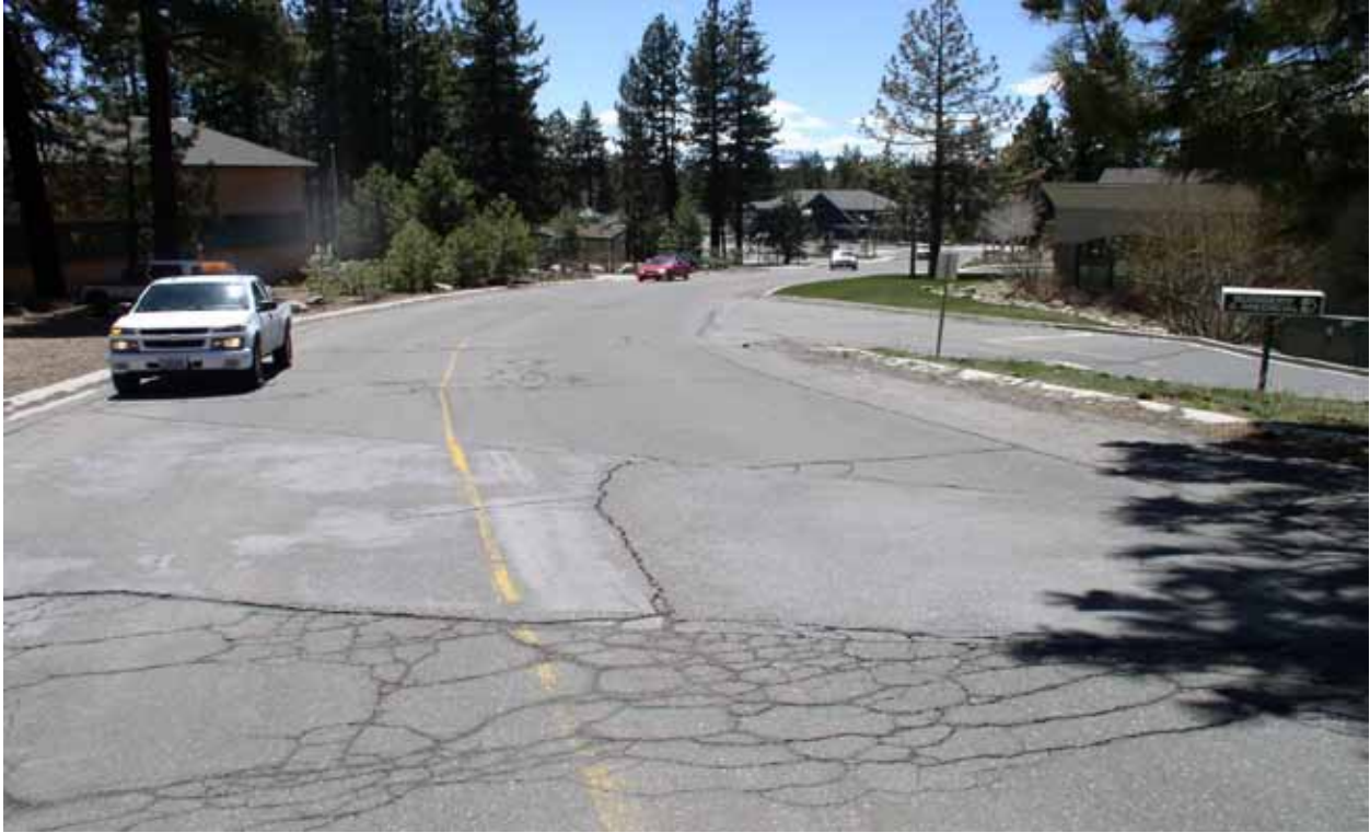
Looking West from station 4+50 on Elks Point Road, Alternate "A" towards start of project at 0+00