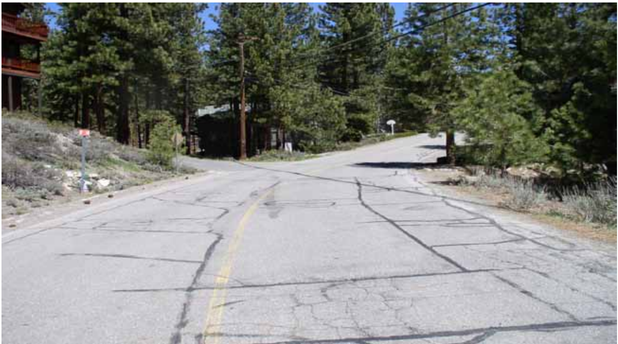
Looking North East on McFaul Way, Sta. 23+50 to 31+00. End of project just past drive on left.