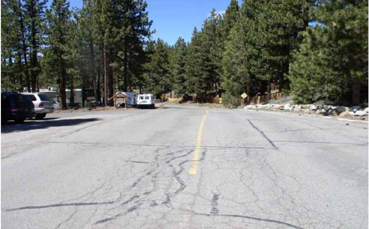
Looking North East on McFaul Way, Elks Point Road to right, Sta. 0+00 to 12+00.