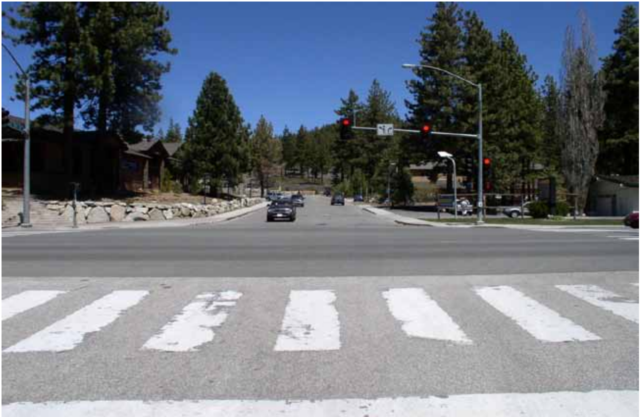
Looking East from Elks Point Road across HWY 50 to start of project at 0+00.