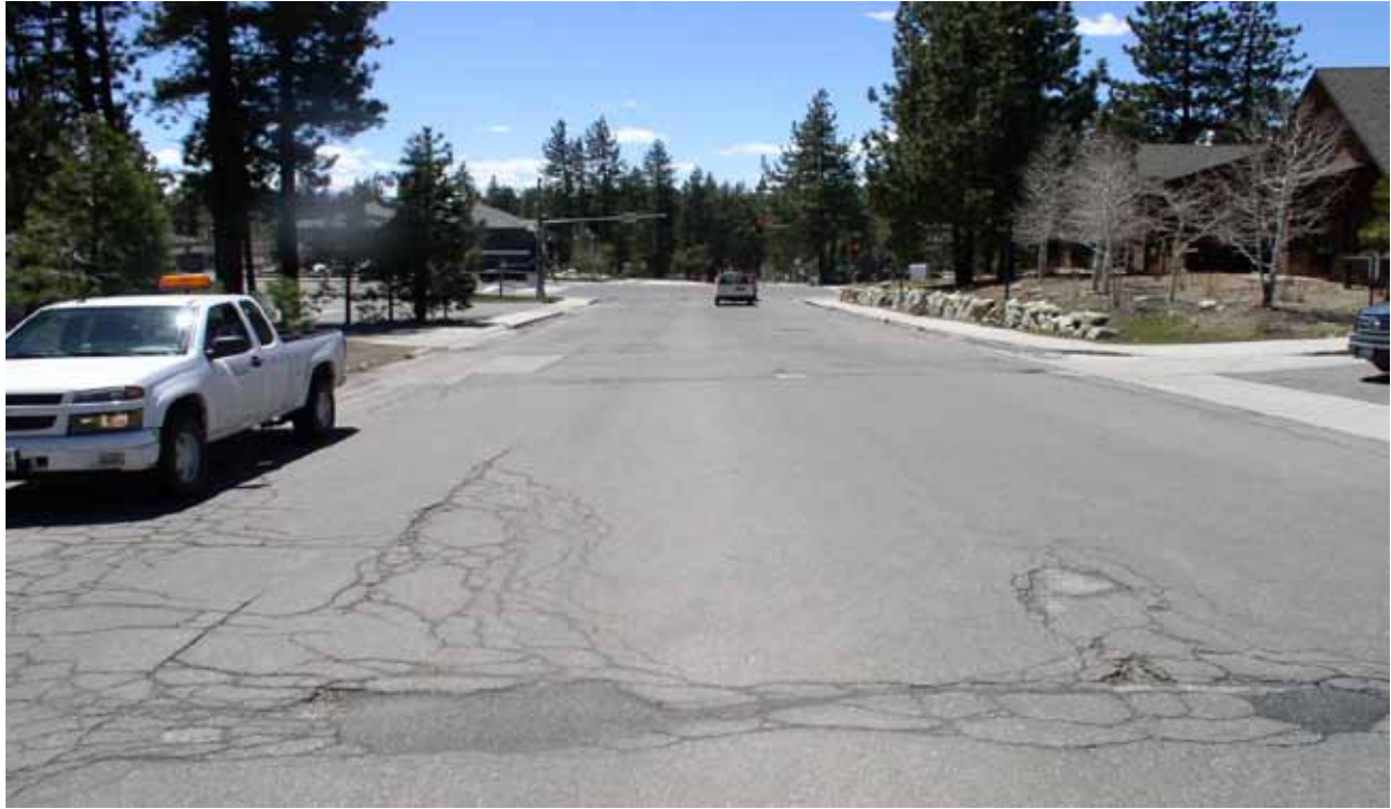
Looking West on Elks Point Road towards 50 Hwy at start of project 0+00.