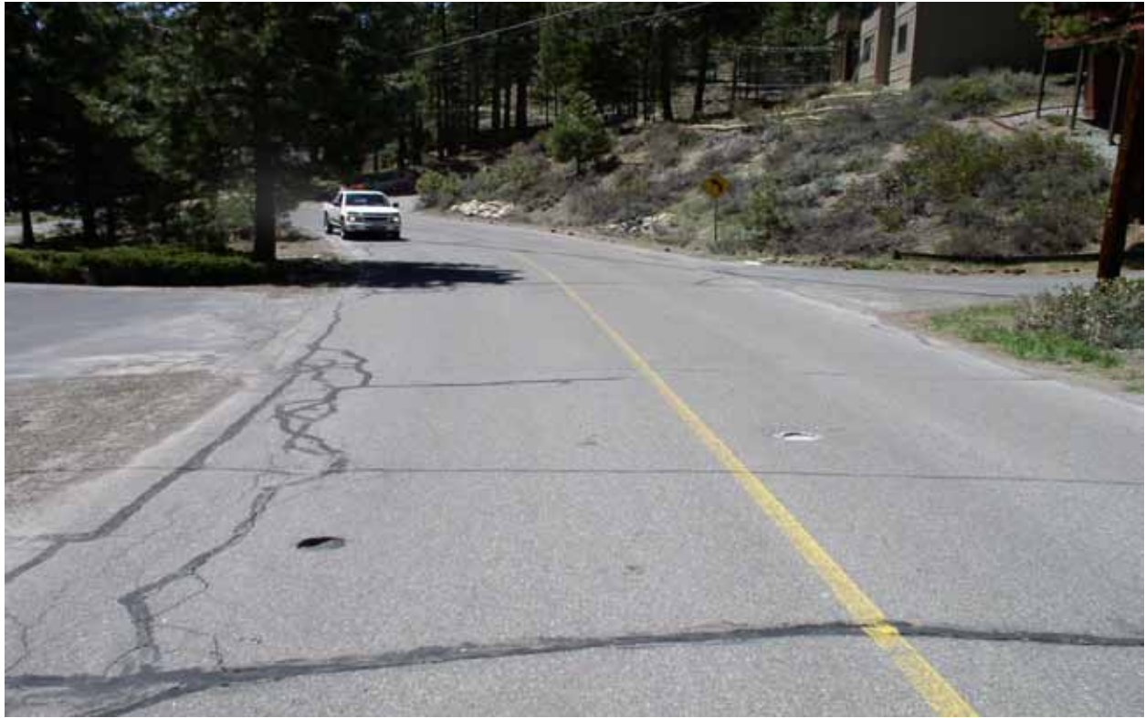
Looking South West on McFaul Way, Sta. 23+50 to 31+00. End of project at entrance on right.