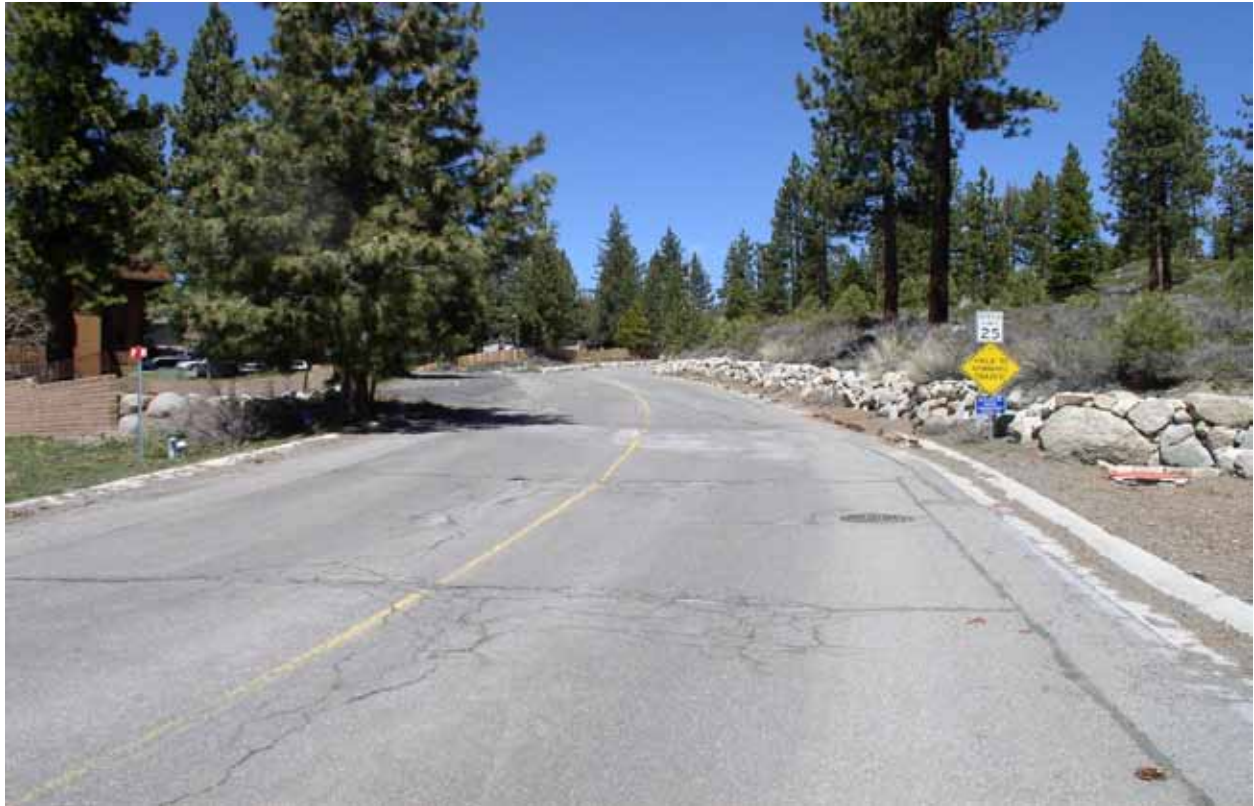
Looking East on Elks Point Road toward station 4+50 Alternate "A" at drive on left. Sta. 0 to 4+50