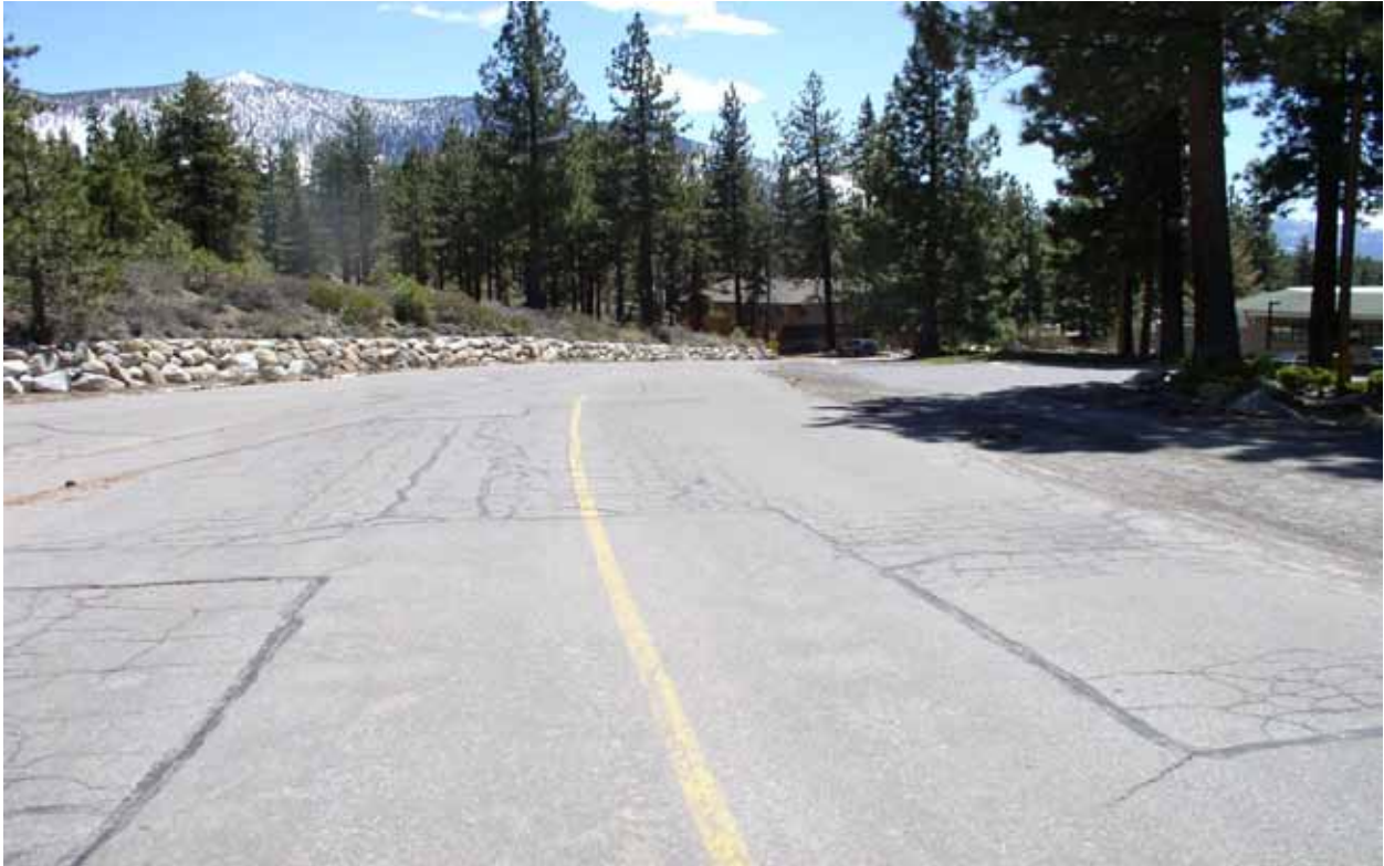
Looking South West on Elks Point Road toward 4+50.