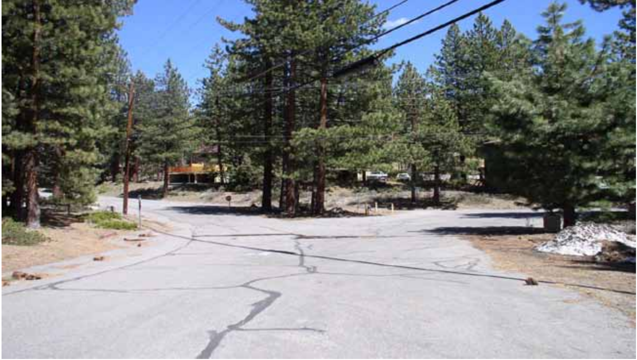
Looking East from Devaux Lane towards McFaul Way, Sta. 12+00 to 23+50