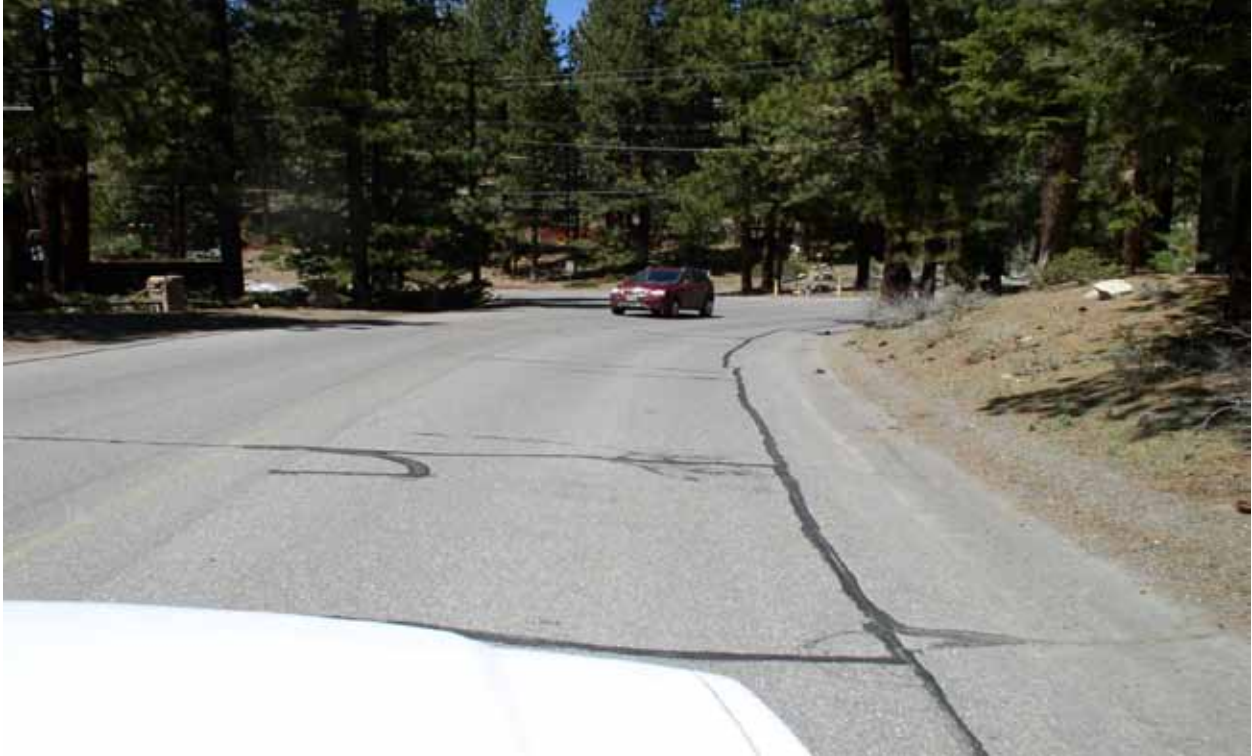
Looking North East on McFaul Way, Sta. 12+00 to 23+50