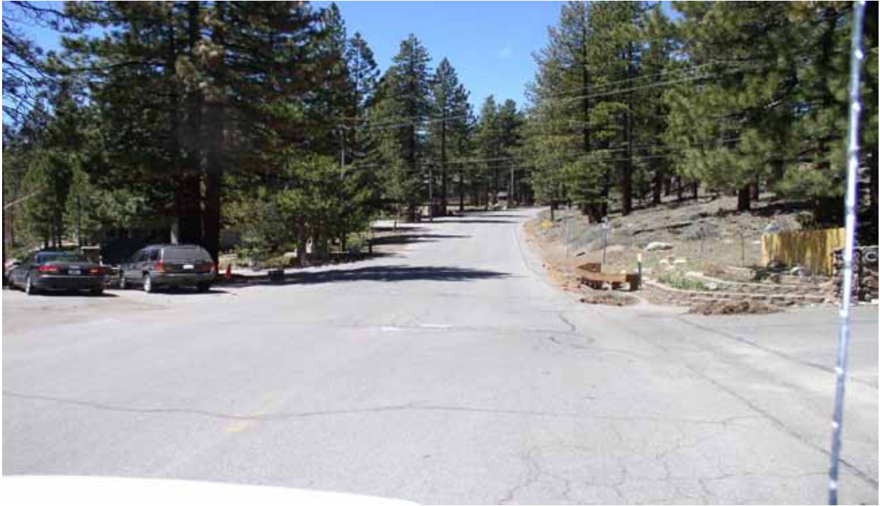
Looking North East on McFaul Way, Sta. 12+00 to 23+50.