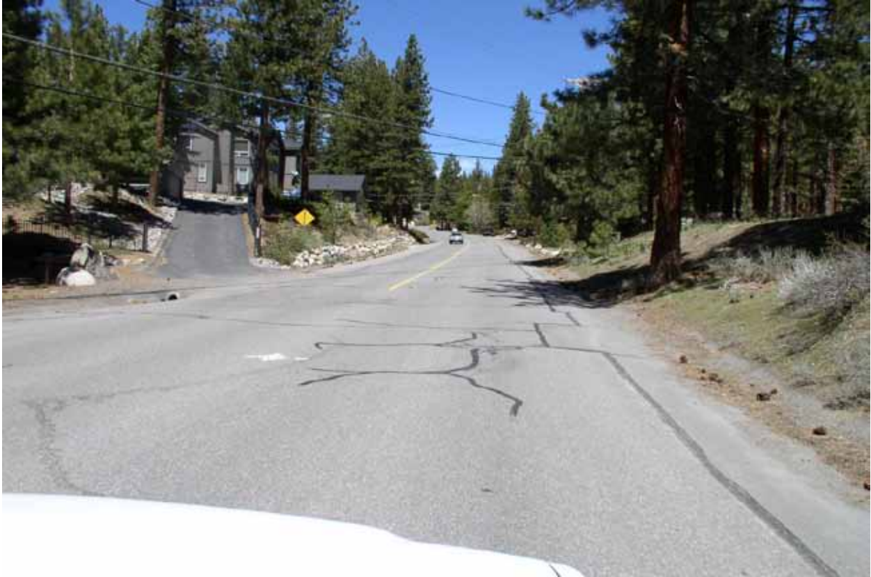
Looking North on McFaul Way, Sta. 12+00 to 23+50