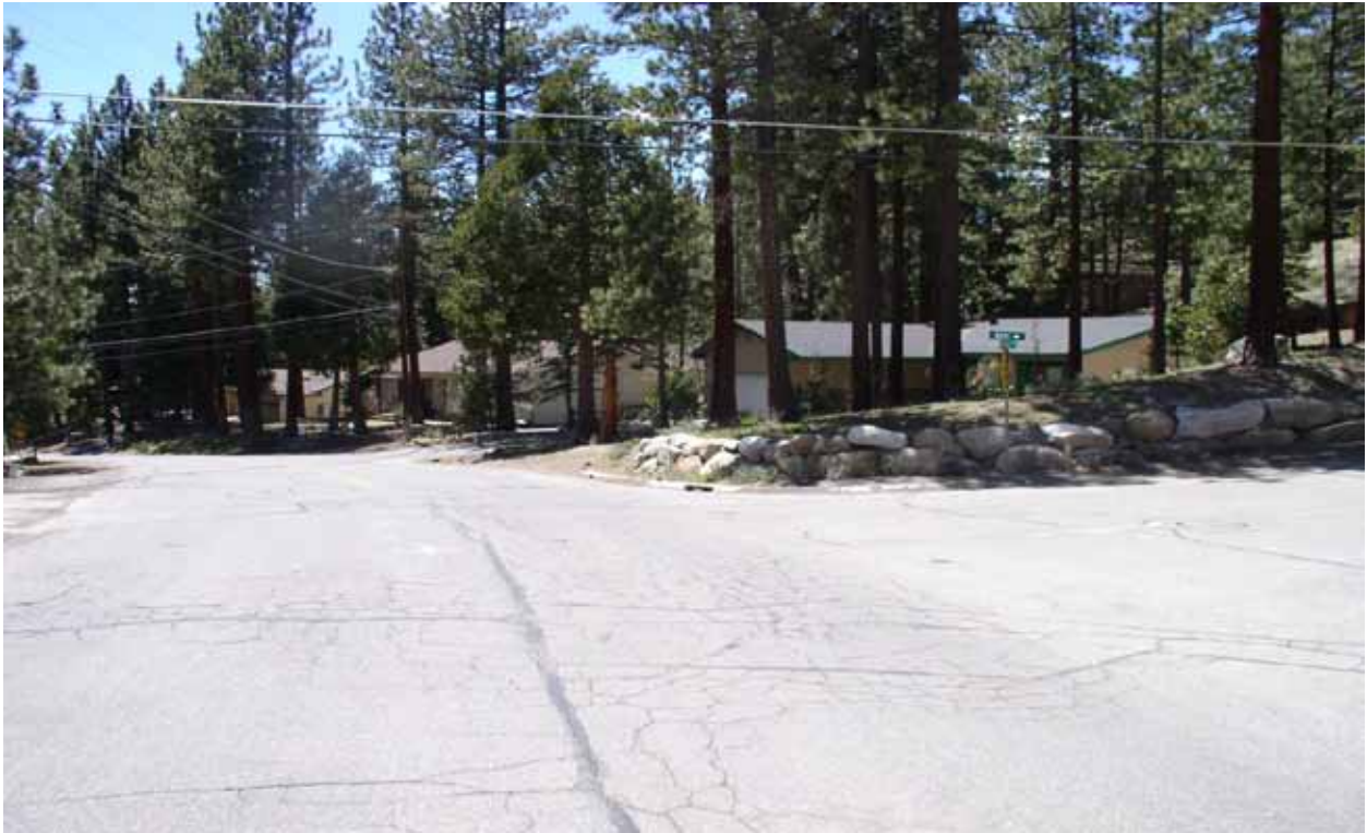
Looking South West on McFaul Way, Sta. 23+50 to 31+00