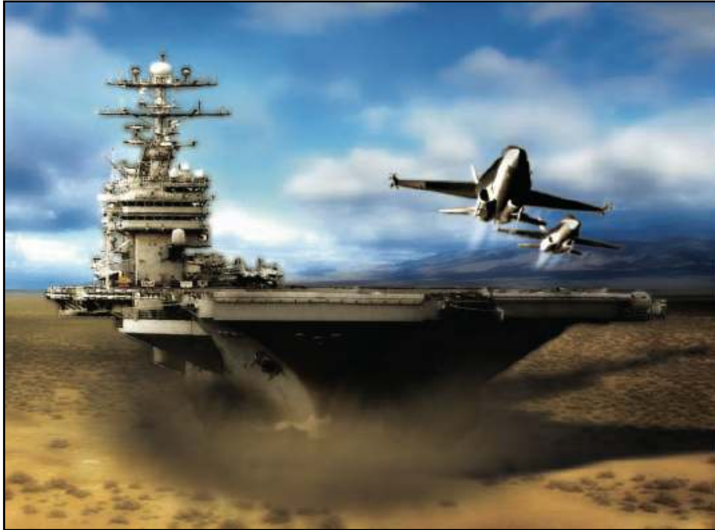
"Nevada's Carrier in the Desert"