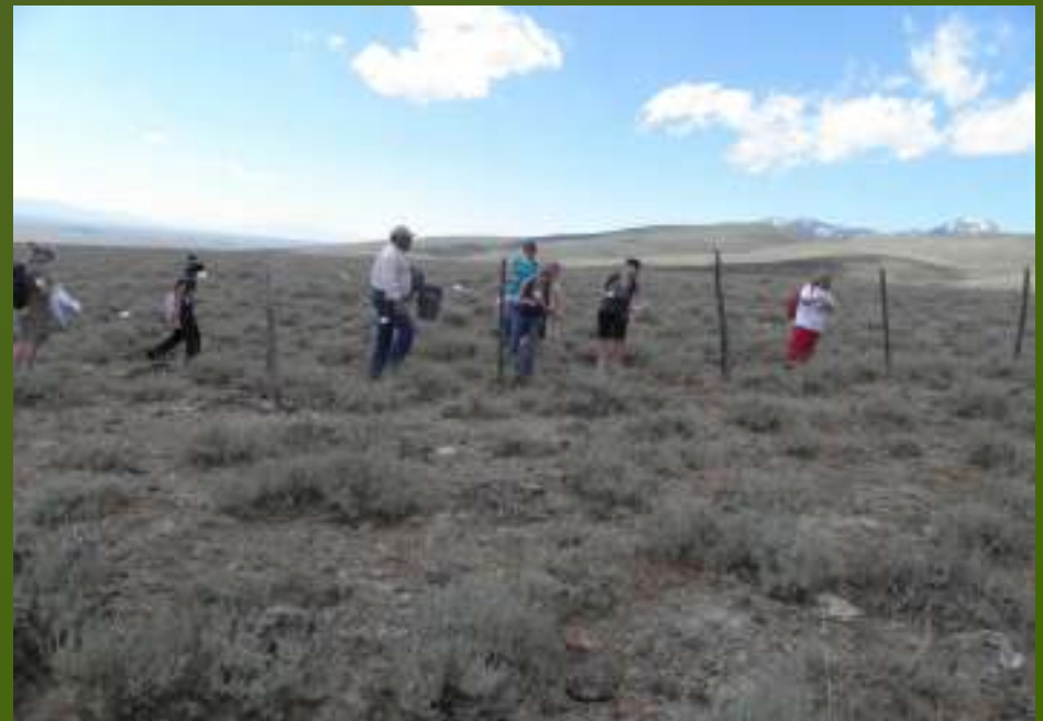
Marking fences in sage grouse habitat